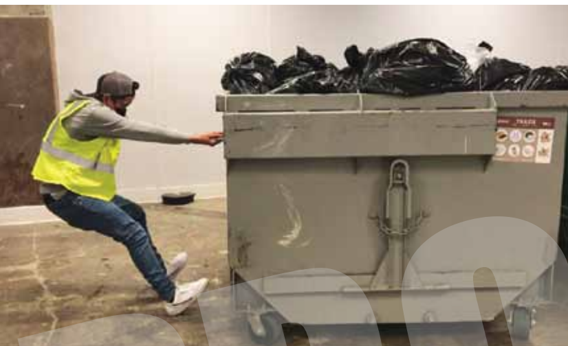
Improper pulling of the dumpster with poor footing and no safety gloves.