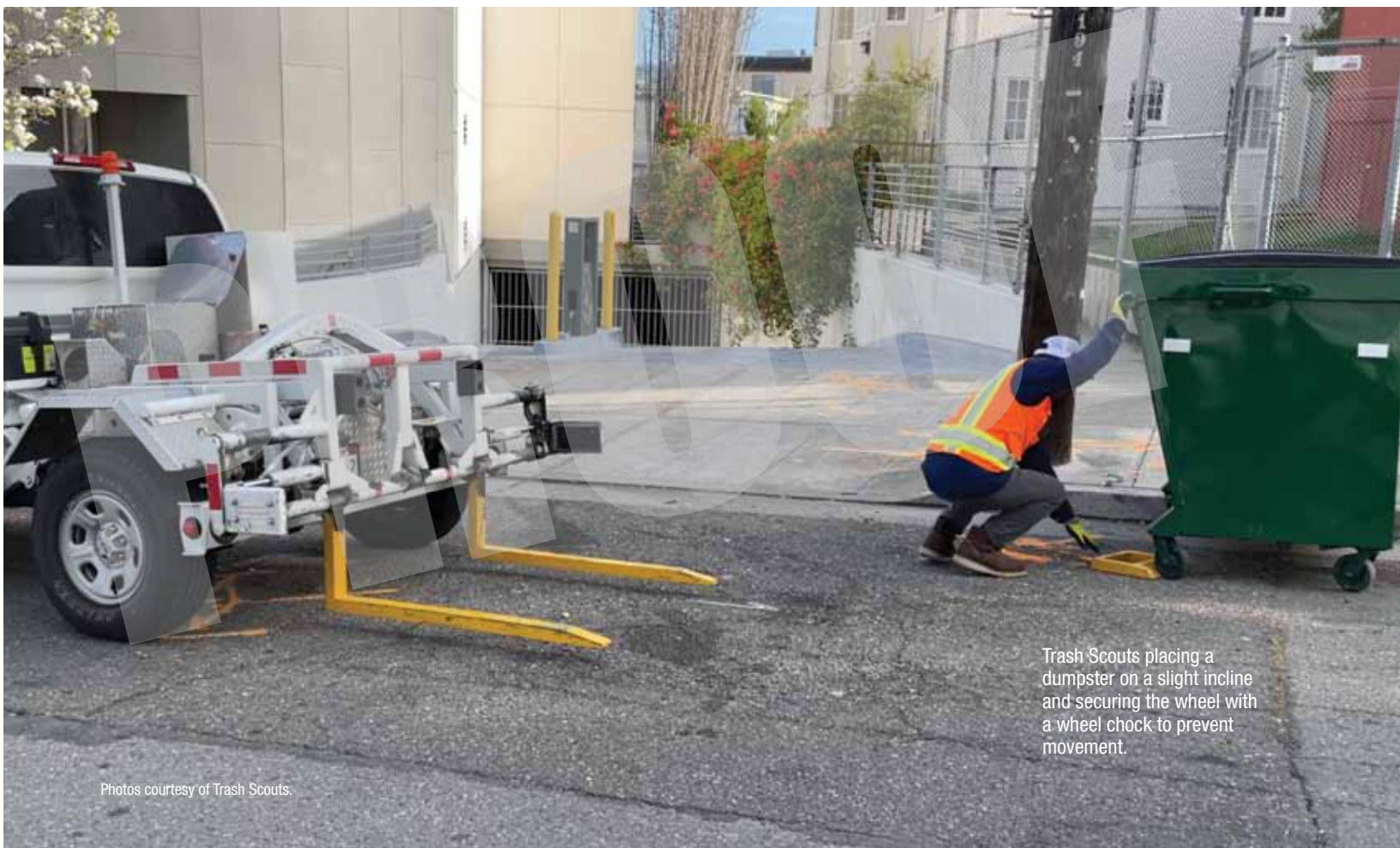
Trash Scouts placing a dumpster on a slight incline and securing the wheel with a wheel chock to prevent movement.

Warm up your body and stretch those muscles. Being properly stretched and warmed up prior to lifting, pulling, or pushing your dumpster or cart can improve balance, muscle coordination, reduce fatigue and greatly decrease the risk of injury.